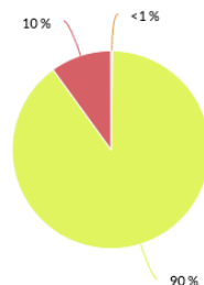
Total capital expenditure