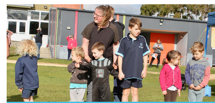
Our little Ludo daycare children couldn't resist the chance to have a little run supported by staff and students

Whilst not all students can place first, second or third, we believe that all students who participated both for themselves and for their House were winners.